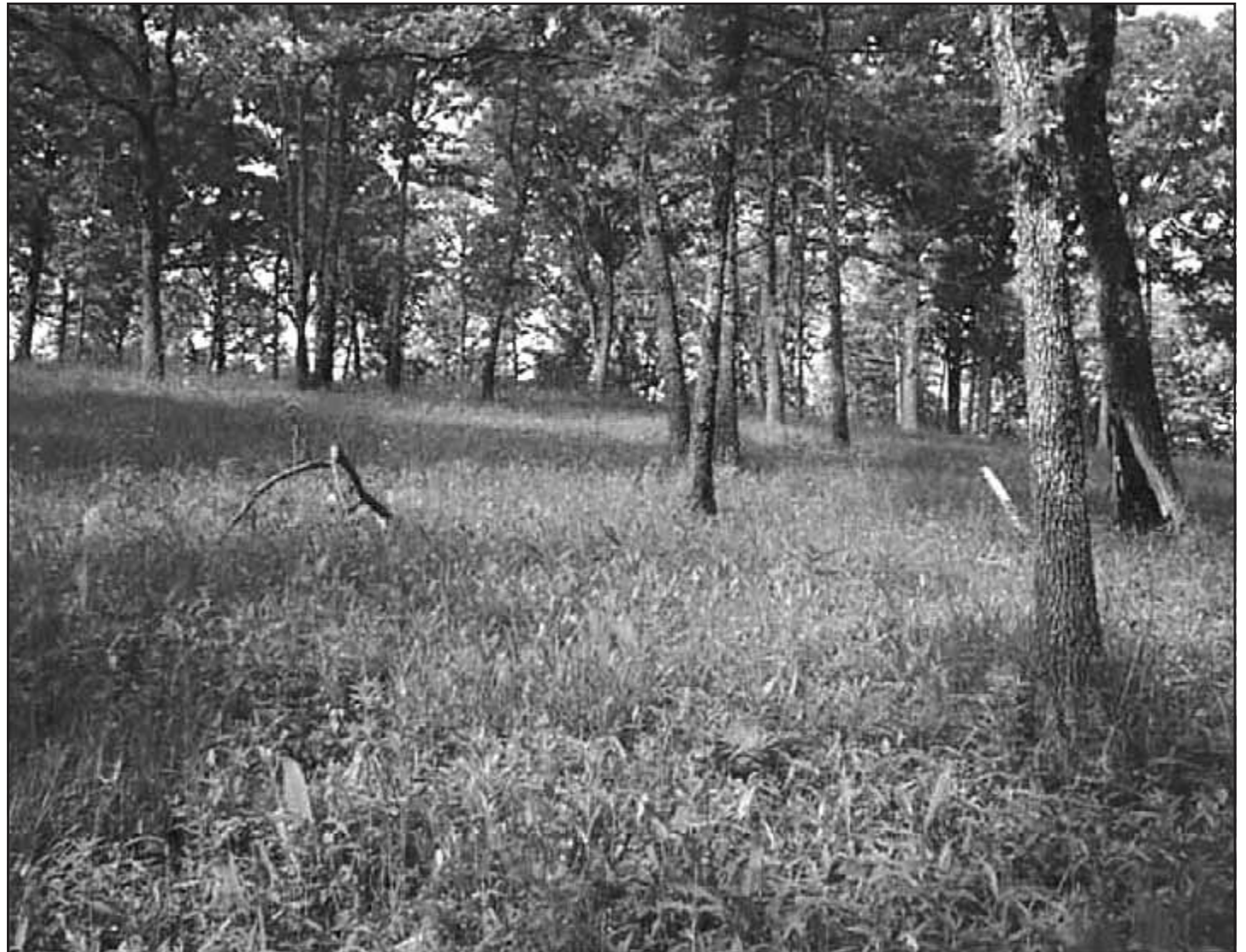
Open woodlands are ideal nesting and brood rearing habitat for turkeys.

Forest Stand Improvement (FSI) is an umbrella term for pre-commercial thinning treatments that involve cutting or killing trees of undesirable species or poor growing stock in order to manipulate forest composition, structure and density. Trees retained after the thinning are freed from competition and can expand their crowns, increasing their mast and woody biomass production. Openings in the canopy result in increased forest regeneration and herbaceous growth on the forest floor. Trees left standing dead create den trees. FSI treatments are tailored to each forest