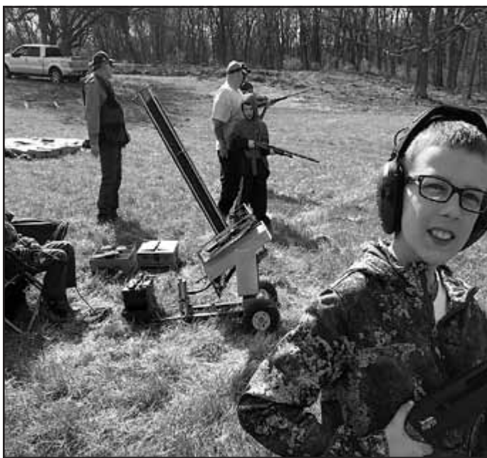
The Parkville Gobblers sponsored Kansas City Boy Scout Troop 1395's Annual Shotgun Campout this year. Around 40 youth went through almost 4 cases of shotgun shells. Many of the children had not shot before this event. This troop also helps with our raffles and auction at the banquet as well as folding and storing a lot of tables and chairs. Nice to give back to the area groups that help us raise money each year.