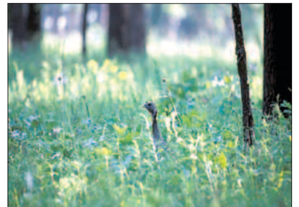
Can you see the poults? Neither can predators.

The good news is that land managers can take steps to improve the brooding habitat on the properties they manage. Both forests and open-lands can be managed in ways to promote a hen's ability to raise young. Good brooding habitat must offer several key components. Abundance of insects is important. Poults require a diet of protein rich insects to facilitate rapid growth. Access to abundant food allows sufficient nutrition and growth rates to rapidly achieve flight. A poult's flightless period is the most critical time of their life in terms of survival. Once turkey poults can roost off the ground, their chances of survival increase dramatically and how quickly they get to this stage is entirely dependent upon insect densities. Another key component is cover. The cover available should be tall enough to provide overhead cover for the poults, but not too tall to limit the hen's vision. Overhead cover is especially important to protect poults from avian predators.