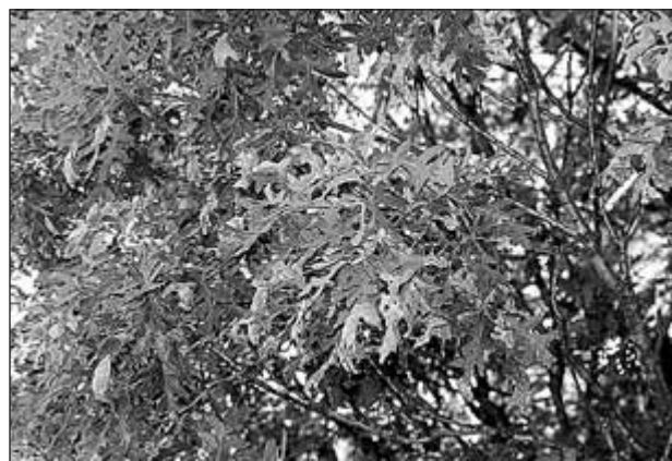
Anthracnose on a pin oak. Although hard to see in this black and white photo., watch for groupings of dead foliage.

Two of the culprits are diseases called Anthracnose and another called Hypoxylon which impact trees in opposite extremes. Anthracnose is caused by a fungus which typically occurs in wet or extreme wet years. Anthracnose affects many species of deciduous trees and shrubs. Shade trees such as ash, maple, oak, and sycamore are commonly damaged. This disease rarely causes death but causes defoliation. More times than not after a wet spell ceases the fungus will dry out and trees will often leaf back out. With years like 2019 these trees were almost never in a dry period and the original defoliation left them bare during the entire growing season. This really becomes an issue when there are back to back years of above average rainfall and the trees have multiple years of defoliation; this is when mortality occurs. Some things that can help reduce the intensity of the outbreak are as follows: Pruning to improve air flow through the canopy may help reduce anthracnose infection. Removing fallen leaves may also help to reduce future infections. Treatment for anthracnose is