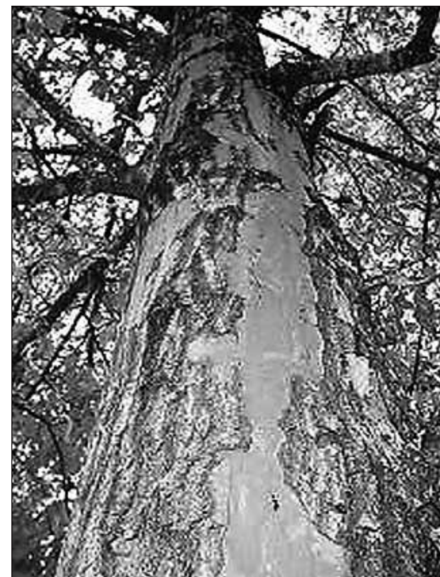
Hypoxylon canker on a Northern red oak.

Hypoxylon is the opposite and more prevalent during dry years such as 2018. This disease also arises from the presence of a fungus but is much more deadly than Anthracnose. If the Hypoxylon canker is visually present on the tree it will not survive. It mainly affects the red oak groups but can affect most hardwoods. This canker affects the sapwood which moves water from the soil to the leaf and ultimately suffocates the tree. Vigorous, healthy trees are colonized by the fungus, but only damaged or stressed trees develop cankers and are killed. Outbreaks of this disease follow severe drought.